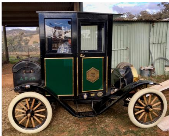
1910 “Top Hat” Brush Model E Coupe