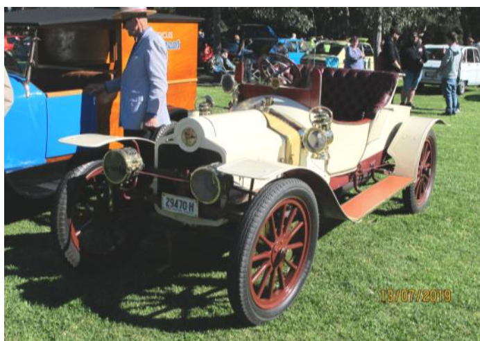
1909 Sizaire Naudin