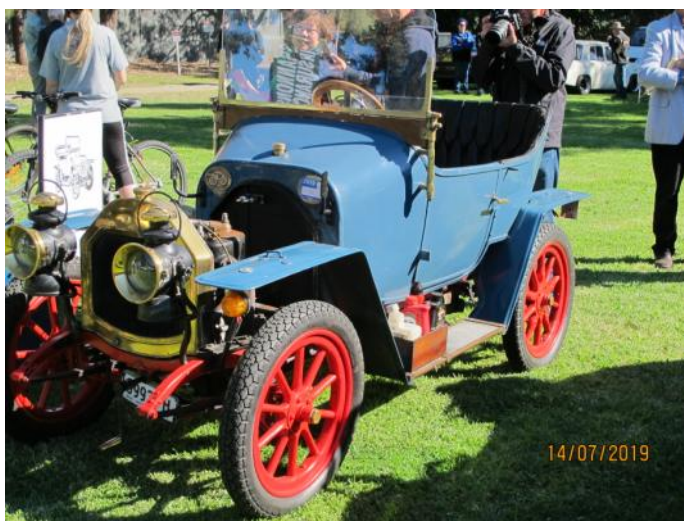
1911 Le Zèbre.