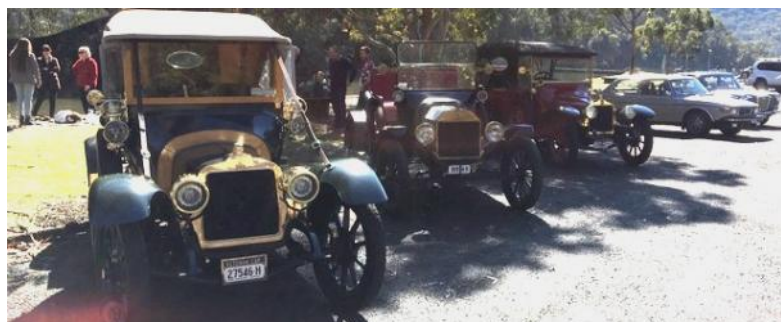
Talbot, Ford T, Talbot, SAAB & Wolseley.