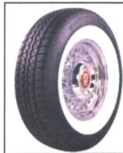
RADIAL WHITE WALL